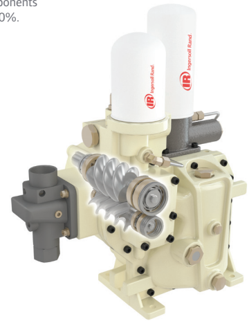
The all-in-one CE55X air end features improved air/oil separation and reliability.