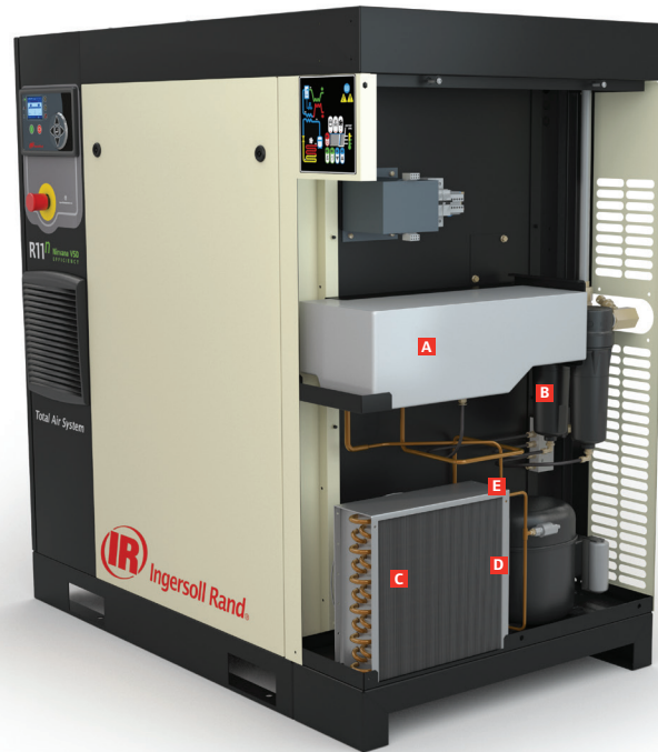
TAS (Total Air System)